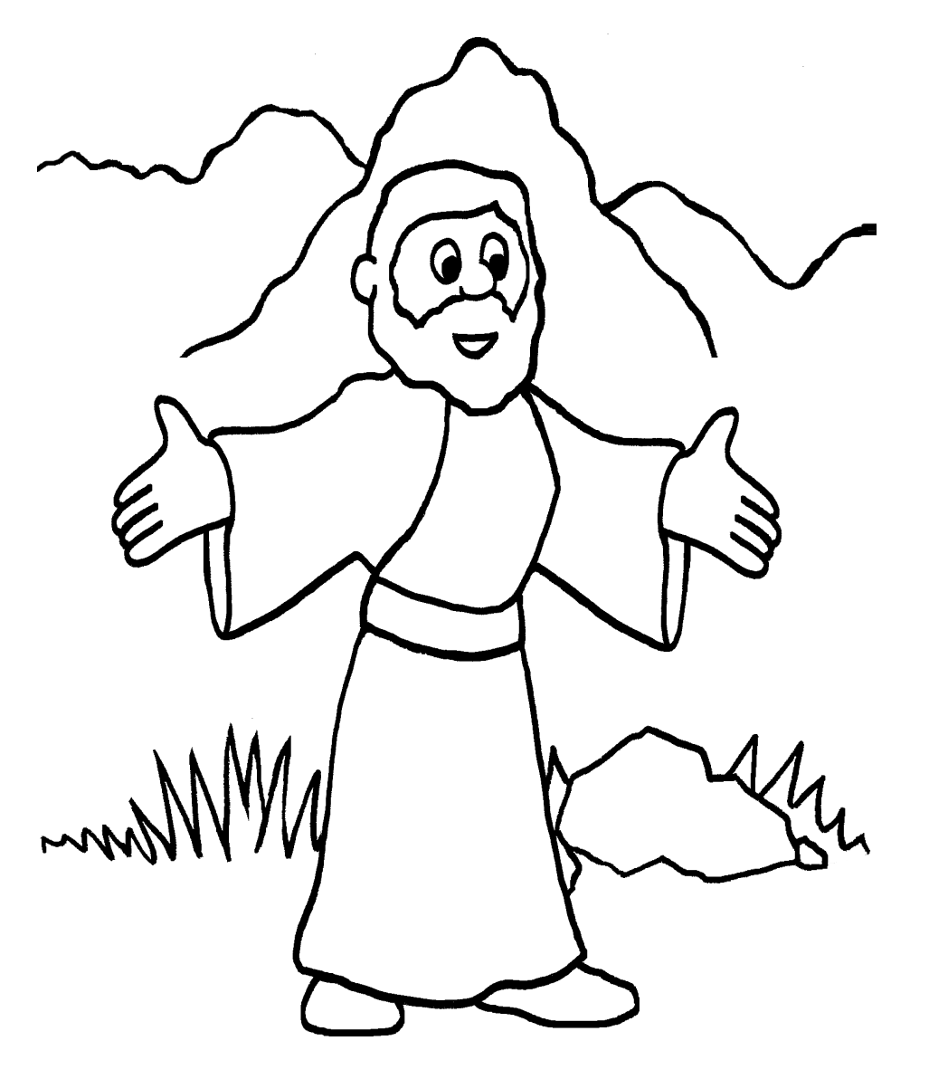
Jesus sent his friends to share the good news and baptize people.