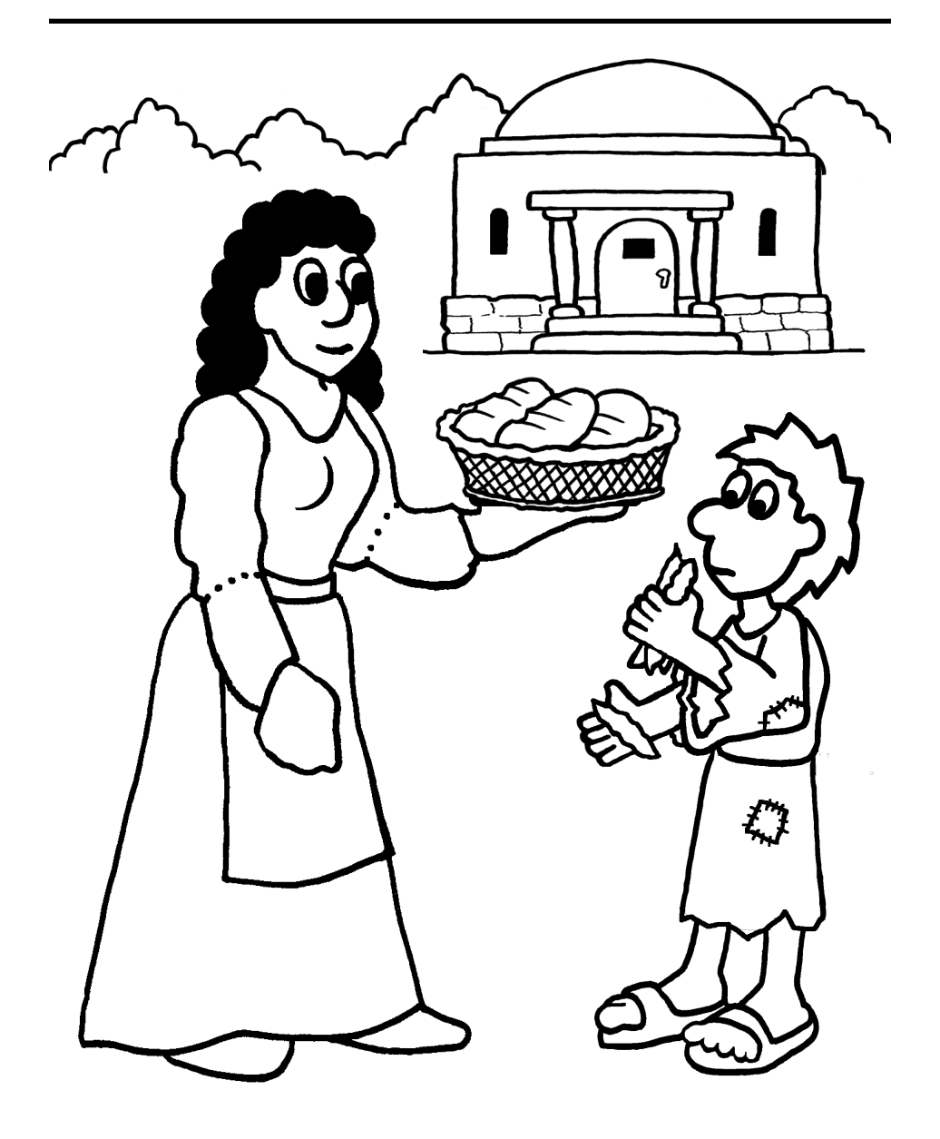
"I was hungry and you gave me food..."

Christ the King Sunday November 26, 2023