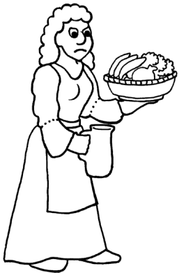
Having a bad attitude