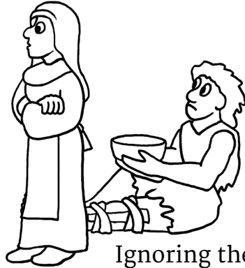
Ignoring the poor