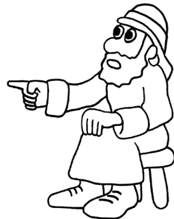
Blaming others unfairly